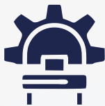
Flooring product/ equipment manufacturers