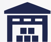
Warehousing and logistics